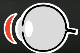
Certificate in Advanced Contact Lenses ACO-CACL