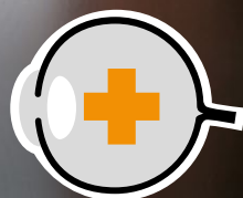
Certificate in Ocular Therapeutics ACO-COT